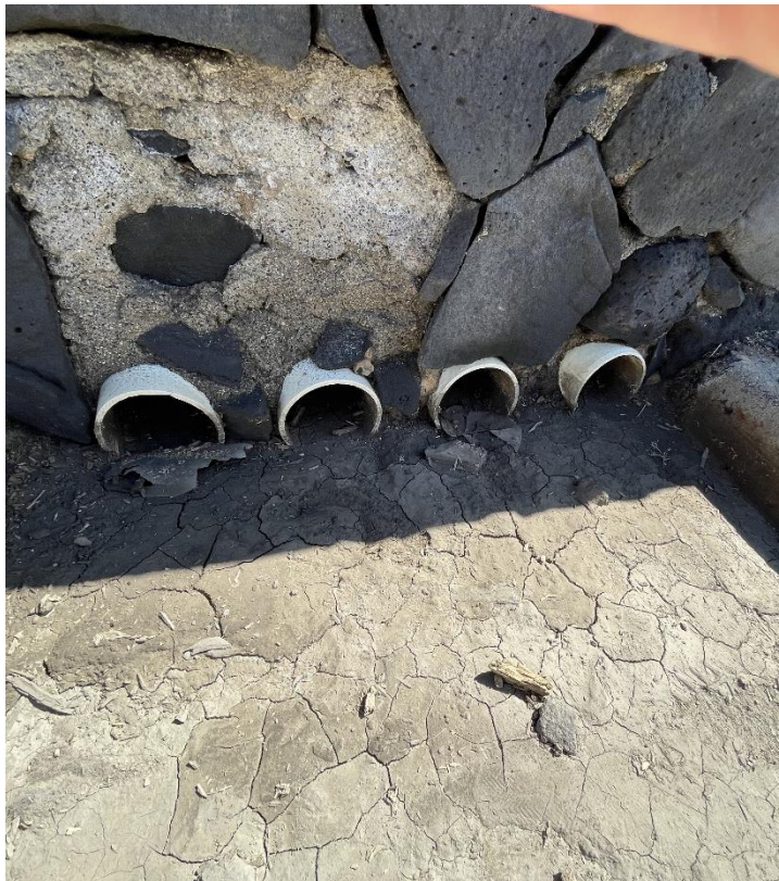
Photograph 6: Example of drainage PVC to be installed in the new CRM wall.