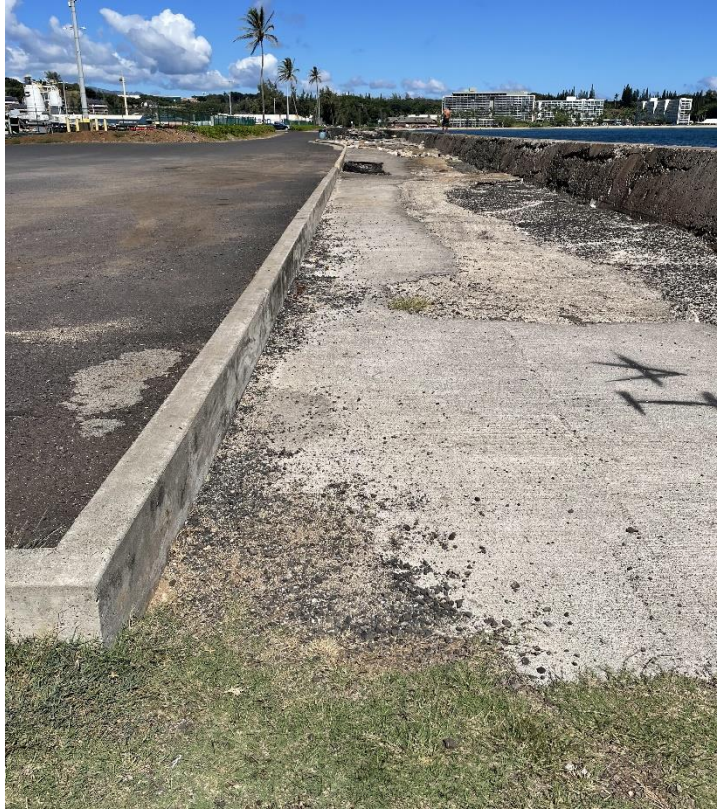
Photograph 5: End of work limit for installation area of new CRM wall