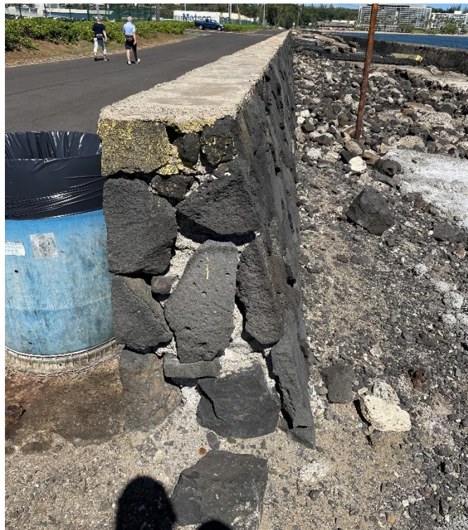
Photograph 2: End of existing CRM wall at the connection to the beginning of new CRM