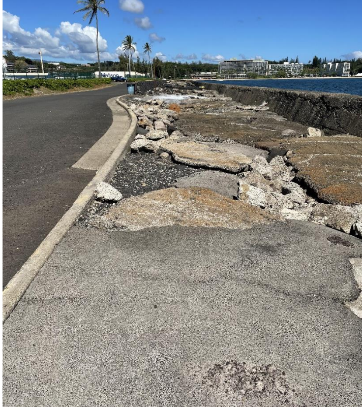
Photograph 3: Existing conditions for installation area of new CRM wall