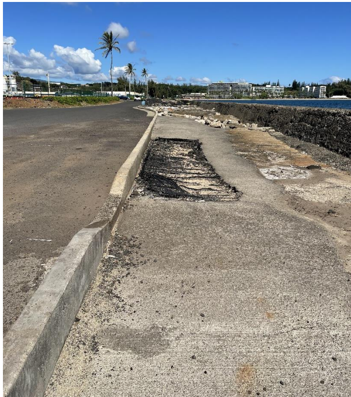
Photograph 4: Existing conditions for installation area of new CRM wall