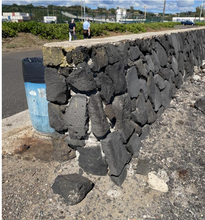
Photograph 1: End of existing CRM wall at the connection to the beginning of new CRM wall